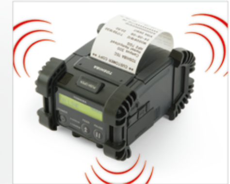
Wi-Fi certified (GH40 model)