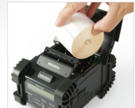
Market-leading media capacity for fewer roll changes