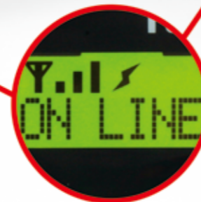
Backlit LCD user interface