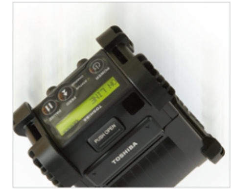
Robust and rugged, withstands a 1.8m drop on to concrete (1.5m for B-EP4)